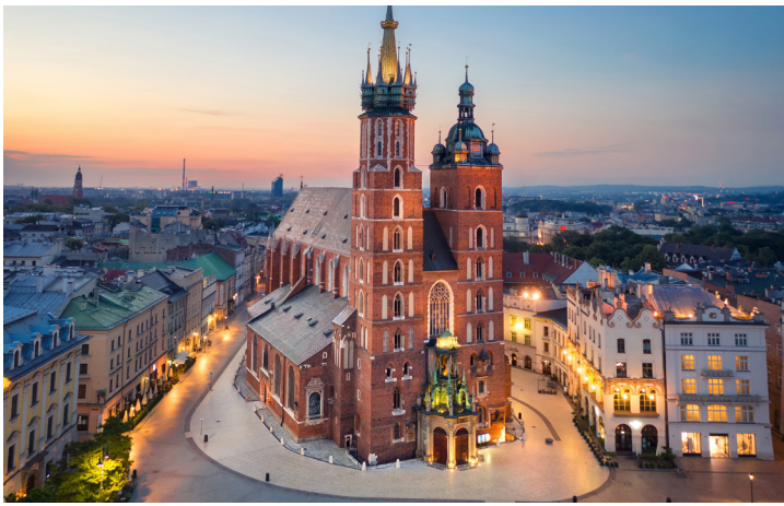
St. Mary's, Krakow, Poland